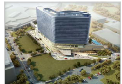
Omni Dallas Convention Center Hotel (Photo Courtesy of City of Dallas Public Information Office)

Source: Enterprise GIS, City of Dallas (base data from Dallas, Denton, and Collin County Appraisal Districts)