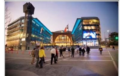
American Airlines Center / AT&T Plaza

lar rail service from Victory Station to MLK Station near Fair Park in September 2009, in time for the State Fair of Texas.